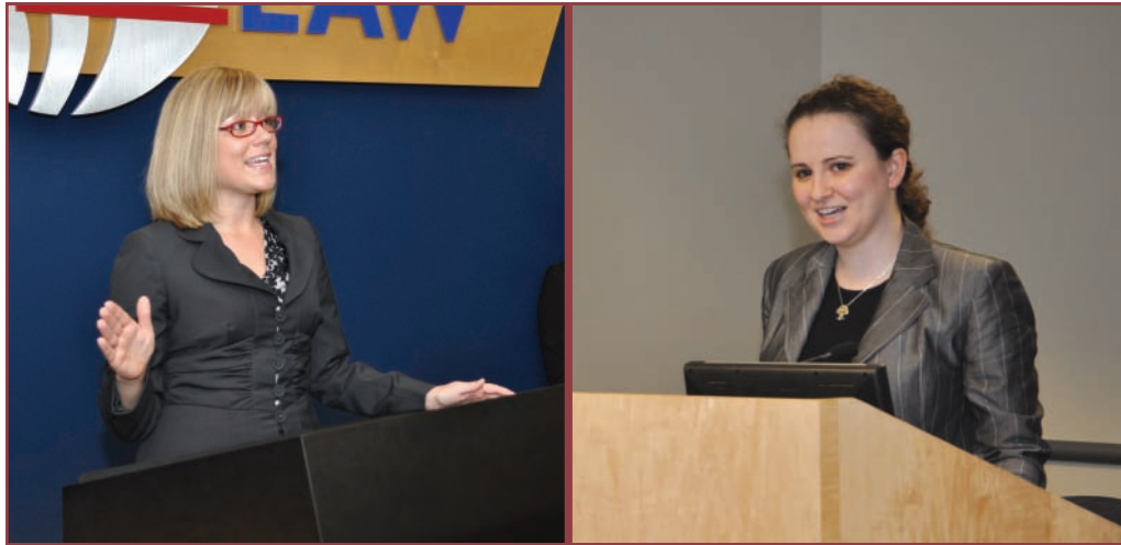
THE STUDENTS PRACTICED THEIR ORAL ARGUMENTS WITH FACULTY AND ALUMNI.