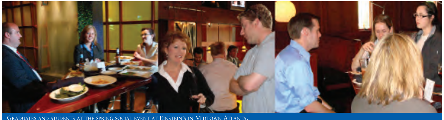
GRADUATES AND STUDENTS AT THE SPRING SOCIAL EVENT AT EINSTEIN'S IN MIDTOWN ATLANTA.

The Center sends out a request for graduate mentors each Fall. If you are a graduate, we hope you will consider sharing the gift of your time and talents with current law students.