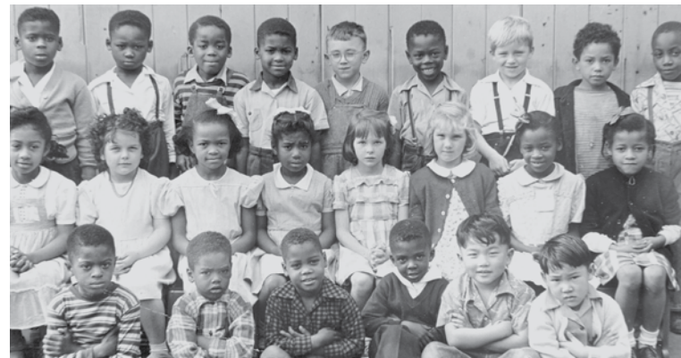
Emerson Elementary School Class Photo

Visit this in-person exhibit examining historic challenges of the past 120 years in achieving health equity in the United States.