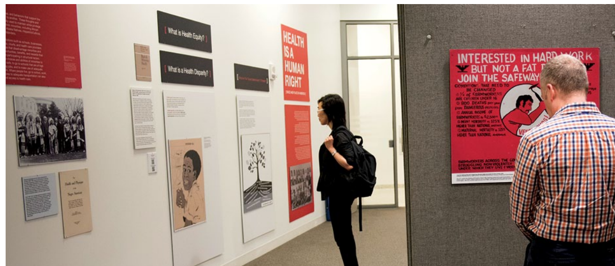
Exhibit Invites Public to Explore Issues of Health Equity in America