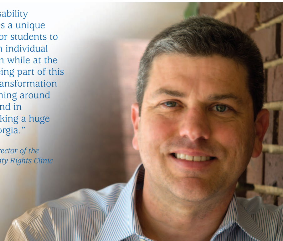
Director, Center for Law, Health & Society